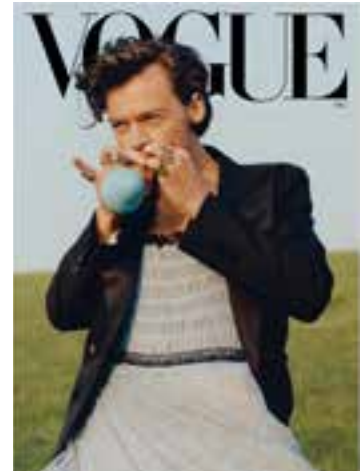
Wearing a Gucci jacket and dress, 2020

Now, 13 years into his career, Styles seems perfectly at home with superstardom. And it's perhaps this authenticity, the currency of social media, that makes him so popular with his many fans. In any case, he seems to be having the time of his life. One thing's for sure: the world can't take its eyes off Harry Styles. Whatever he does next is bound to be interesting.