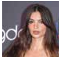
Styles's romances with the big girls have made headlines