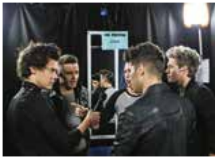
One Direction: This Is Us , the feature film from 2013

In 2017, he released the album Harry Styles , showing us his inner rock star with the song "Sign of the Times". The video featured a moodier Harry singing out the ballad on the lonely Isle of Skye. A massive hit on both sides of the Atlantic, the song killed off his teen idol image.